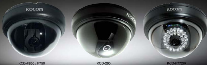
KCD-F850 / F750