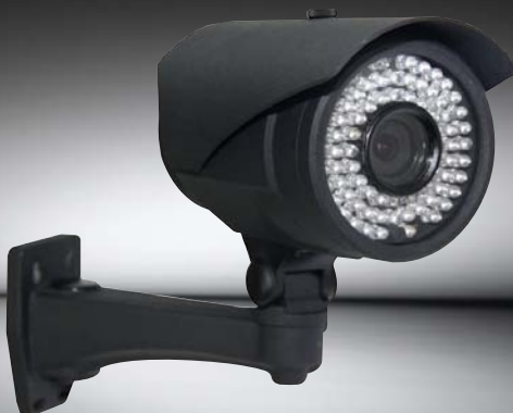
WDR Long distance View Day &amp; Night IR LED Varifocal Sense up Camera